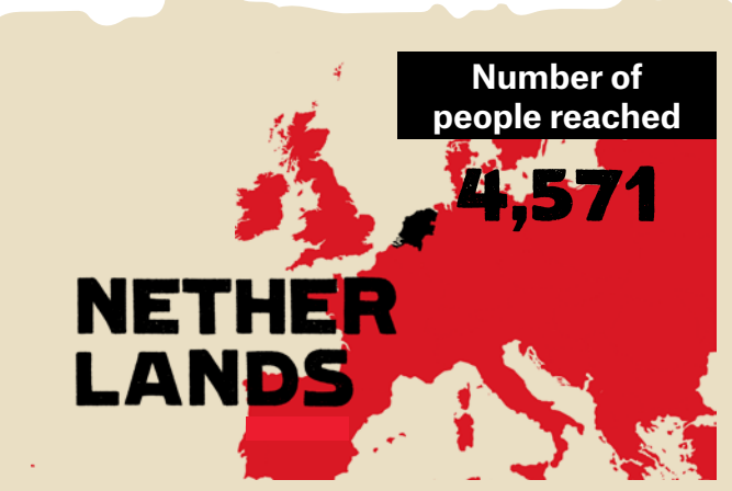
Coordination. Resource mobilisation. Advocacy. Adaptation of War Child's signature programmes.